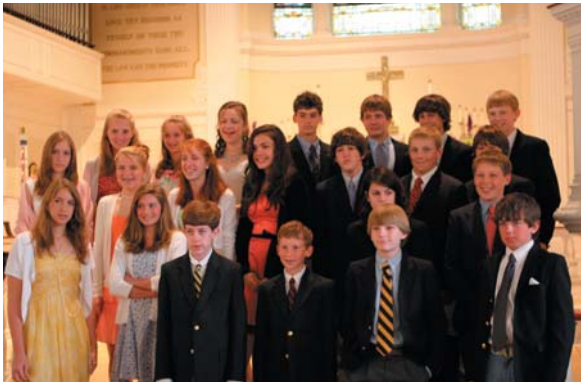
8th Grade Confirmation Class on May 19 at St. Stephen's, Ridgefield.

Congratulations to this group on an amazing year!