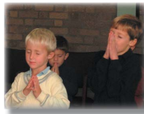
Church school children in reflective prayer during a Sunday morning yoga session.